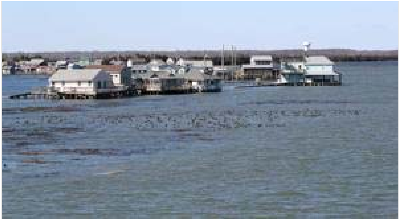
New Jersey shore sees sea level change — and it can't be denied