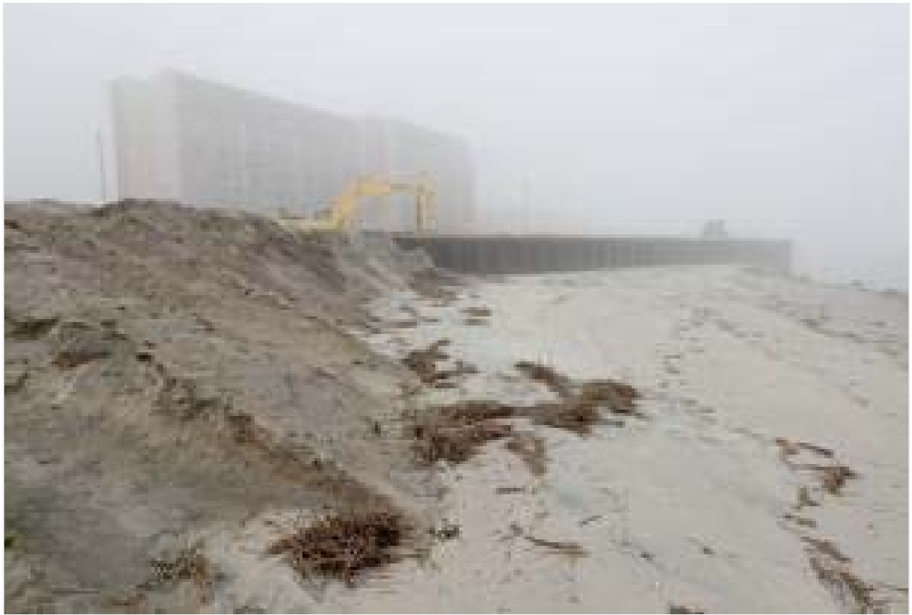
North Wildwood starts $1.5 million beach replenishment project