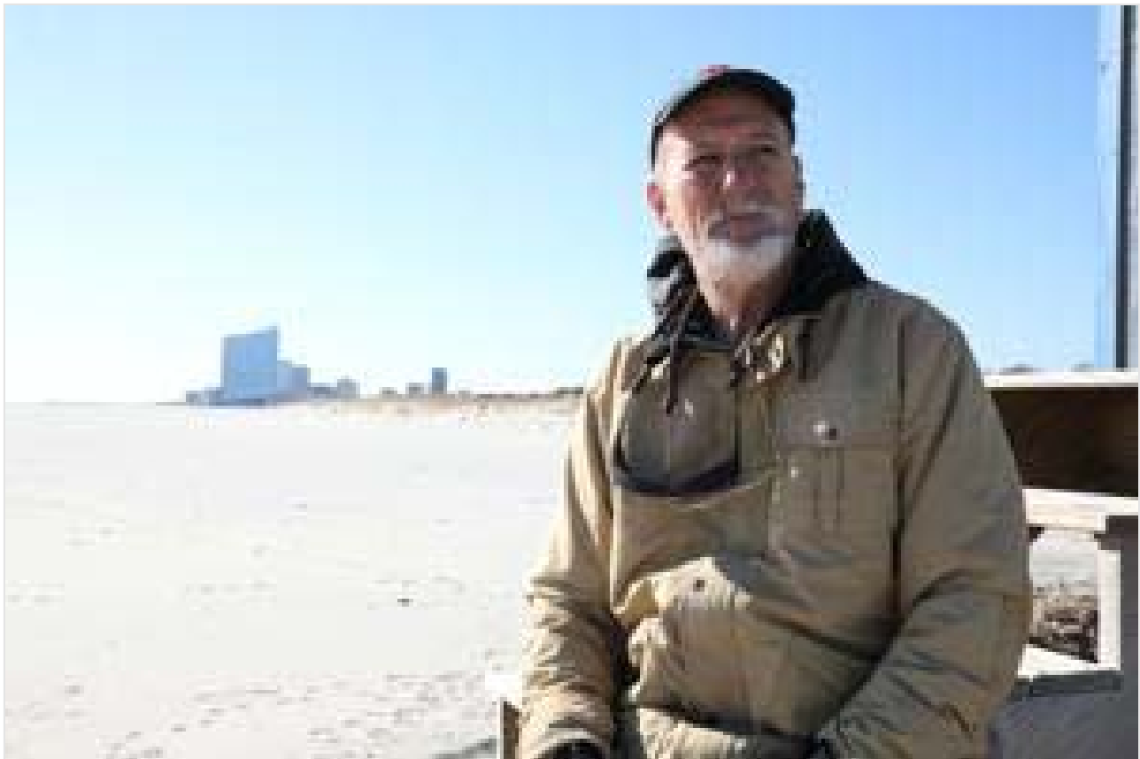
30 years of shifting sands