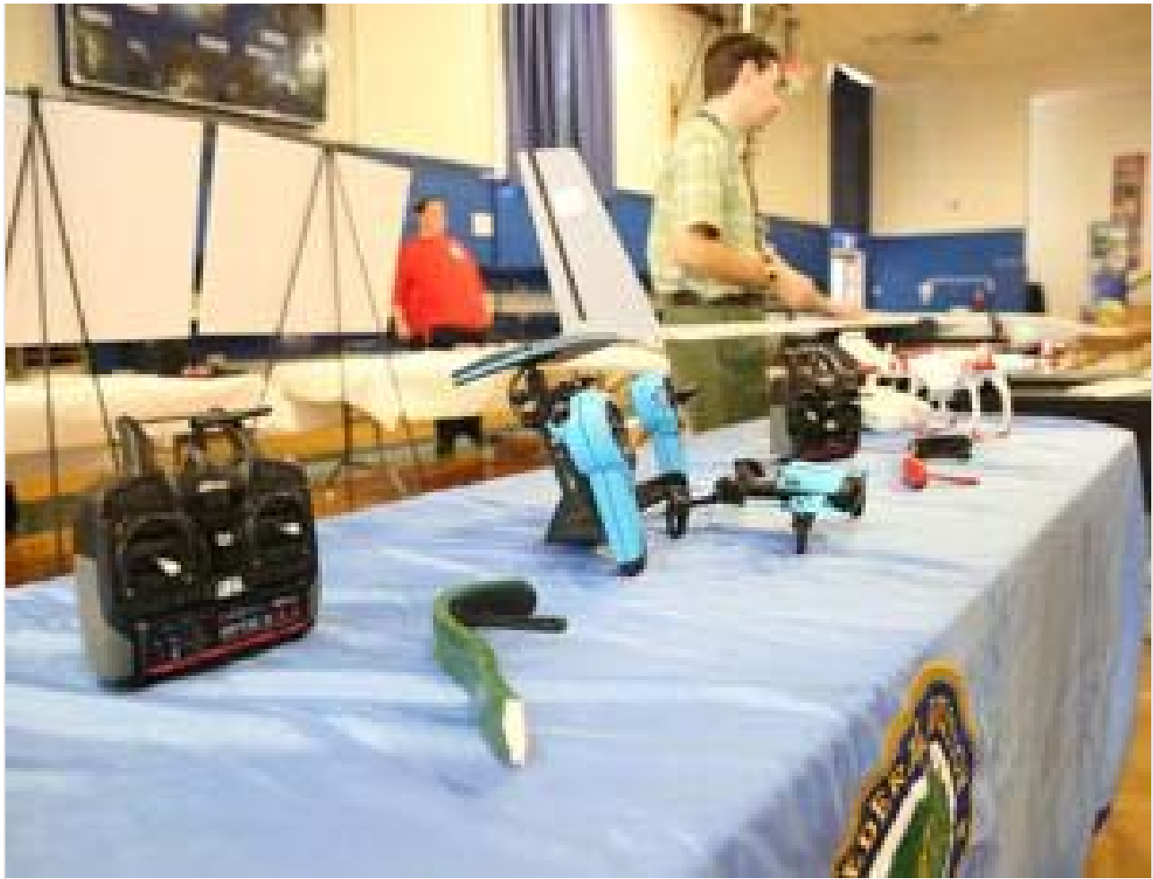
New Jersey Emergency Preparedness Conference returns to A.C. this week