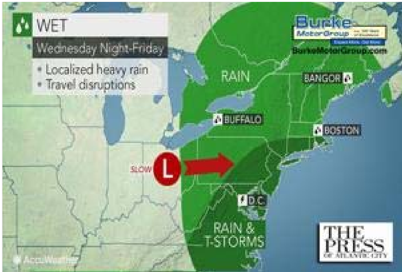
More wet weather Thursday, but will it dry out in time for the holiday weekend?